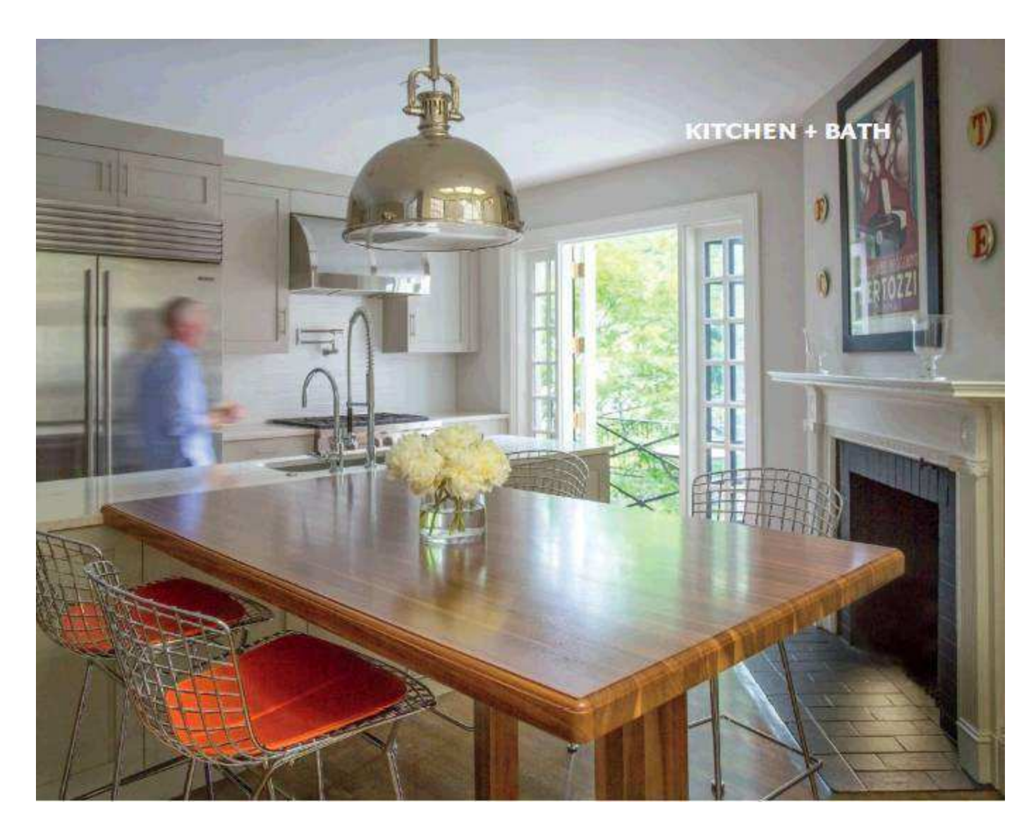
A POLISHED CHROME pendant light fixture from RH that hung in the former kitchen was reused above the table. The iconic Midcentury stools were designed by Harry Bertoia.

To appeal to her more modern taste, custom Shaker-style cabinetry by Metropolitan Cabinets in Norwood, Massachusetts, was painted a warm gray and the crown moulding was removed. "There is a much more streamlined, clean look to the design now," says Swanson.