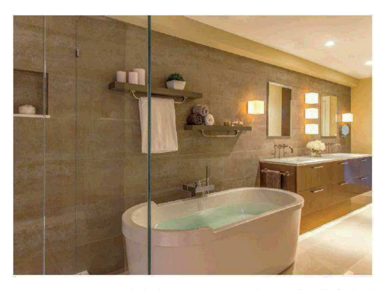
A WALL OF large-scale porcelain tile gives the master bath spa-like appeal. The LED "Cubi" wall sconces by Leucos Lighting contribute to the decidedly contemporary ambience.

Swanson worked with Jean Brooks Landscapes of Cambridge, Massachusetts, to select plantings for containers around the deck. Bold orange Janus et Cie umbrellas that pivot in all directions are bolted to the new Trex flooring, keeping them stationary when the wind picks up. "We didn't have proper umbrellas before. Now we are able to be up on the deck at all times of the day," says the wife. "It's really become a whole new floor to the house for us. We love it."