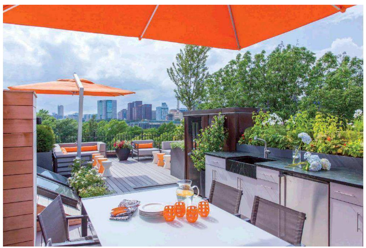
The outdoor dining set (TOP PHOTO) is also from Allegro Classics. The table has a tempered glass surface on an aluminum base.

Briefly, the owners of this five-story brownstone in Boston's Beacon Hill considered moving out of the city. As their two sons approached adolescence, they saw the appeal of leafy suburban neighborhoods, expansive backyards, and two-car garages.