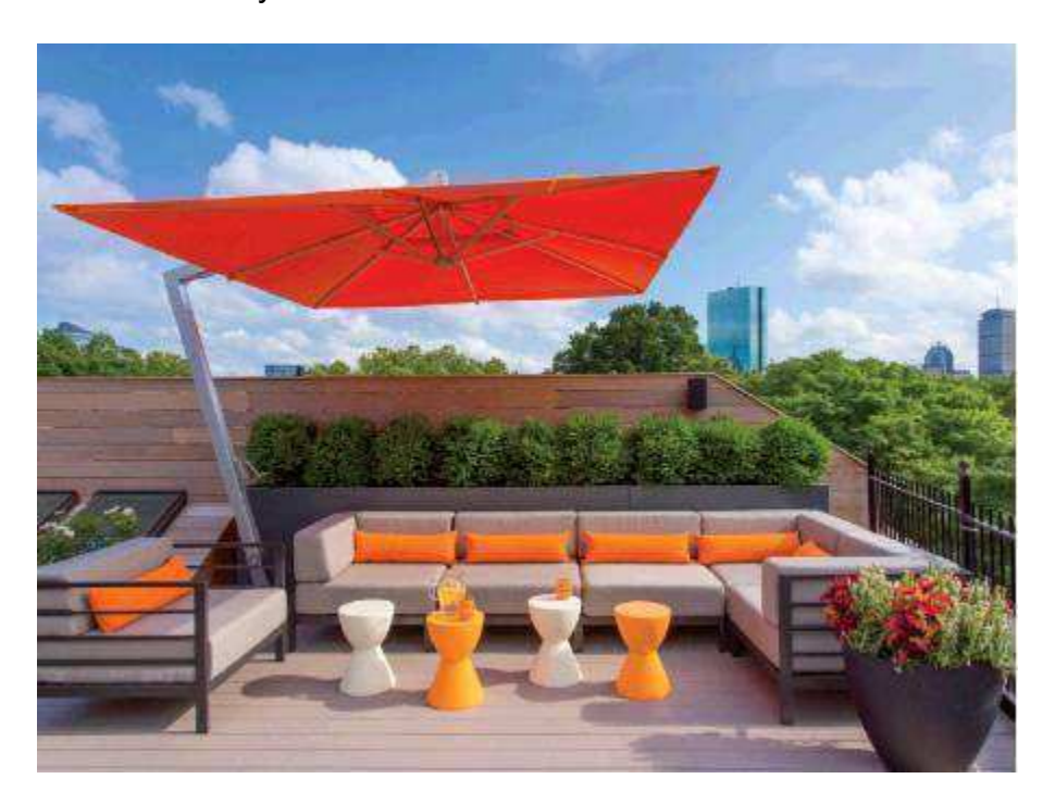
A PIVOTING UMBRELLA makes it possible to enjoy the roof deck even on the hottest days of summer. The sofa and sectional are by Allegro Classics; handy stools that also serve as tables are from Design Within Reach.

Once the homeowners decided to stay in the 1918 town house for the long haul, they reached out to Swanson to draft plans for renovations tailored to their lifestyle. The priority was the first-floor kitchen. "I bake, and my husband loves to cook," says the wife. "We like people to gather around us when we're working in the kitchen. We couldn't do that with the layout."