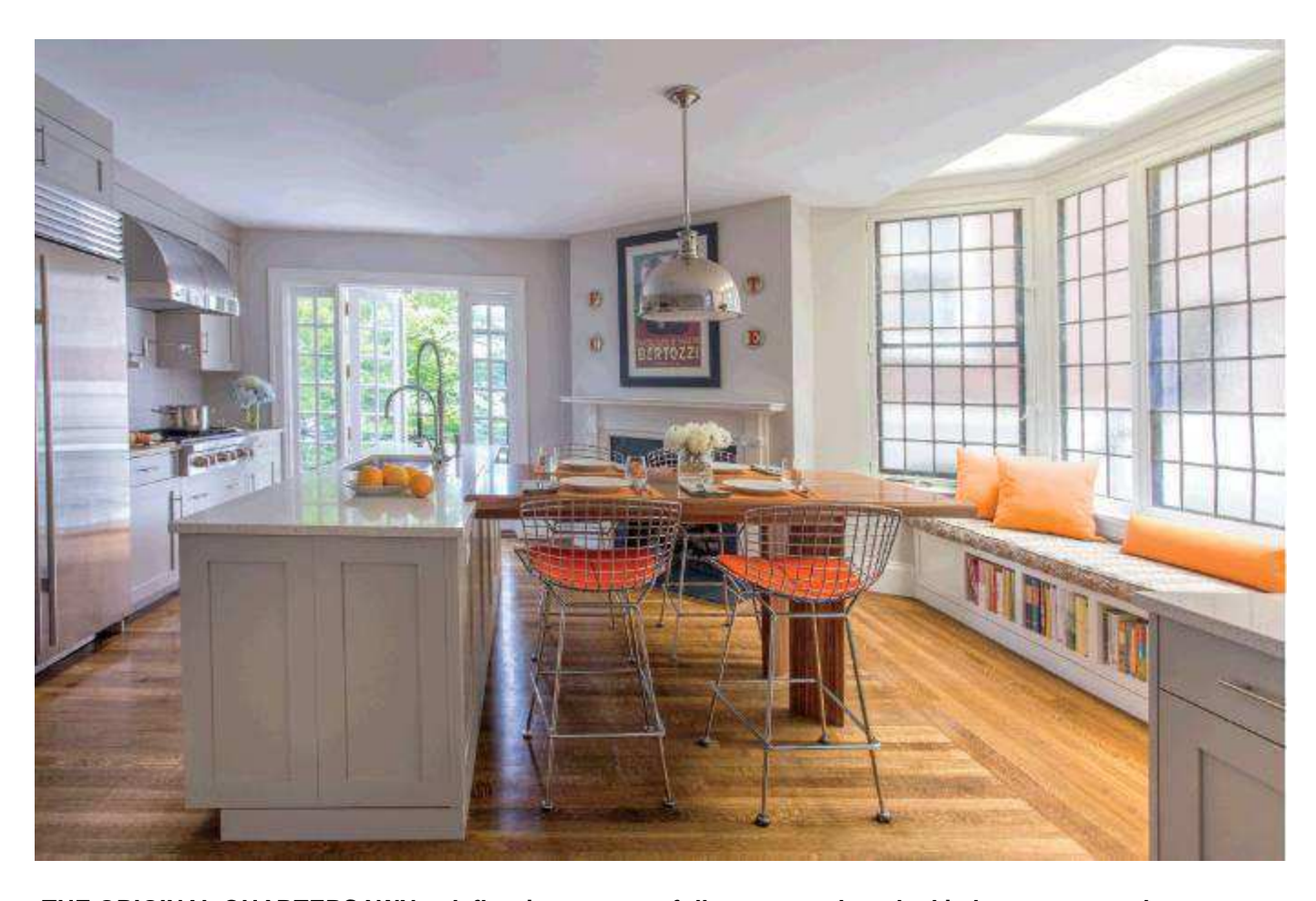
THE ORIGINAL QUARTERSAWN oak flooring was carefully torn up when the kitchen was gutted. The wood was relaid and stained to blend in with the additional planks needed to accommodate the new layout.

While the footprint remained unchanged, Swanson reconfigured the room to make it more functional. Working with contractor McHugh Custom Builders of Roslindale, Massachusetts, he installed a large island and an ample countertop next to the cooktop to provide plenty of prep space. Two sinks and distinct work zones make it possible for husband and wife to cook concurrently. For casual family dining, Swanson designed a walnut table attached to the island at counter height. It provides seating for four and views of both the fireplace and bay window, where Swanson installed a window seat with storage for cookbooks underneath.