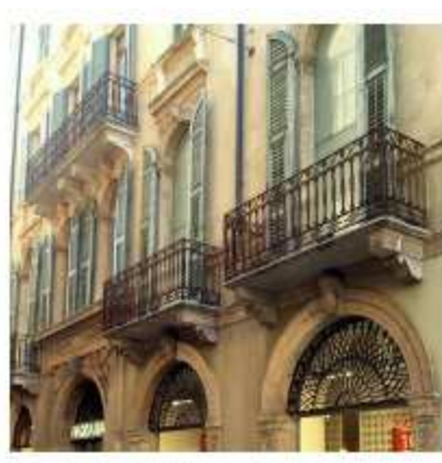
On the way to "Julia's Bakery" in the town of Verona. Maybe 30 feet deep, covered in blue this all over!